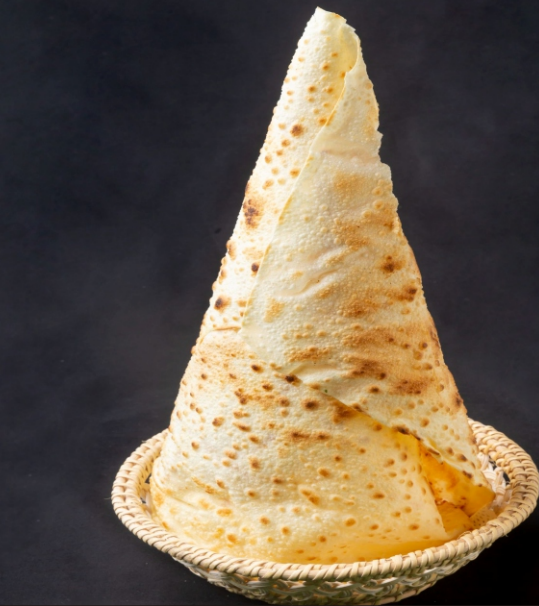
Roti Tissue 高塔甜脆餅 $60

Butter/Garlic flavour tandoori-baked and leavened flatbread