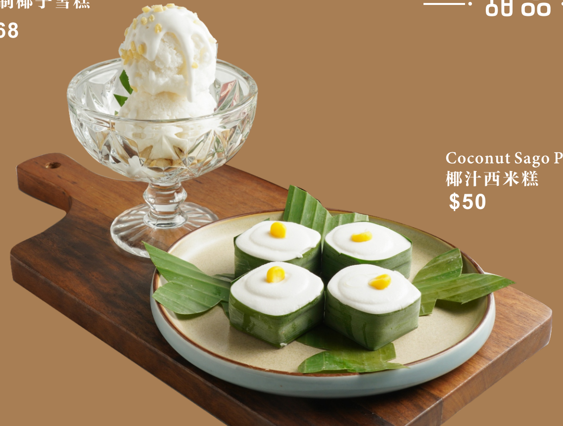
Coconut Sago Pudding 椰汁西米糕 $50