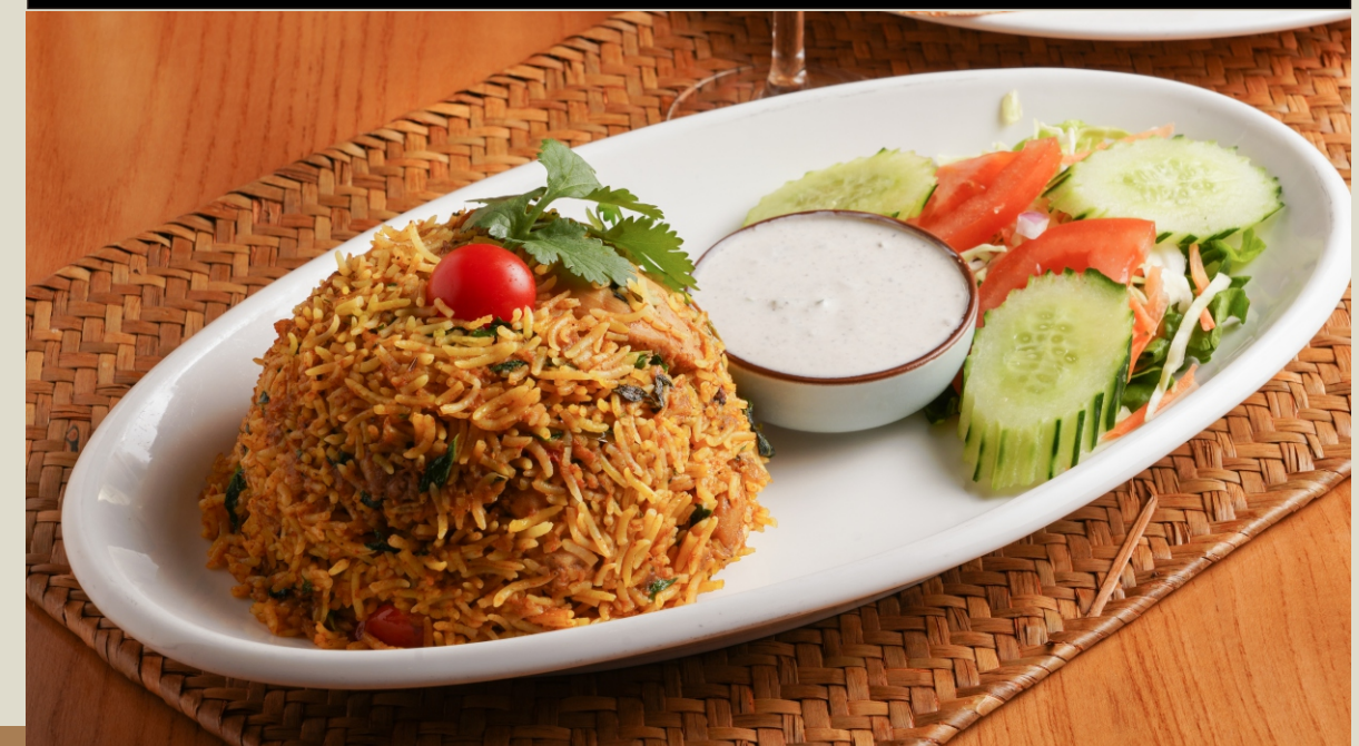
Chicken Biryani 印式雞肉香料飯

Indian long grain rice cooked with tender chicken and Indian spice