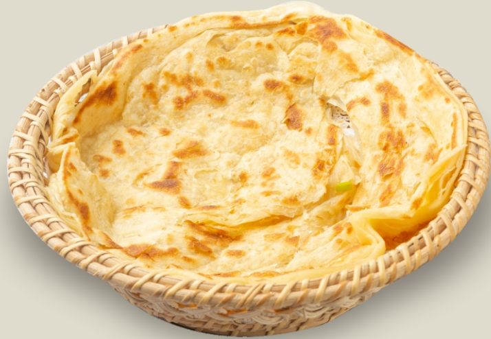
Roti Canai 印式酥油薄餅 $45

An Indian influenced crunchy, moreish flatbread dish, made with flour and ghee