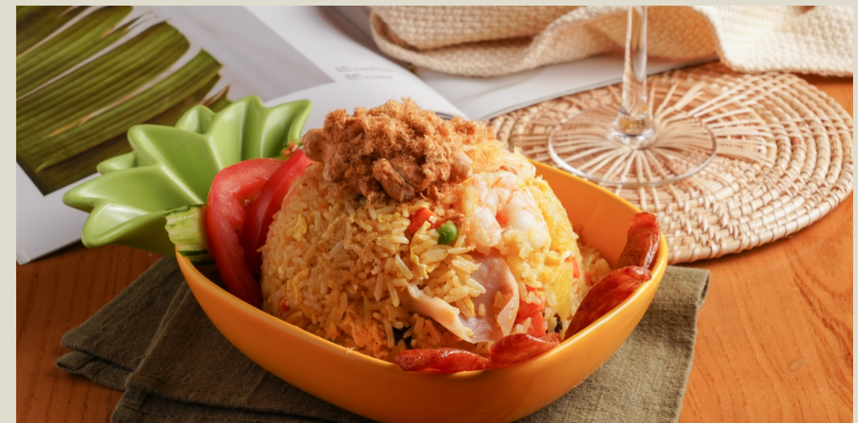
Seafood Pineapple Fried Rice 菠蘿海鮮炒飯