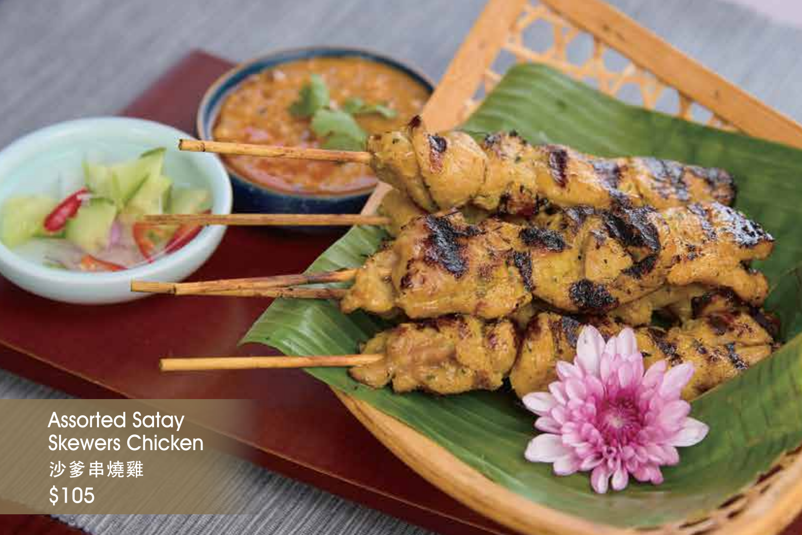
Assorted Satay Skewers Chicken 沙爹串燒雞 $105

Fried Chicken Wings with Fish Sauce 泰式雞翼