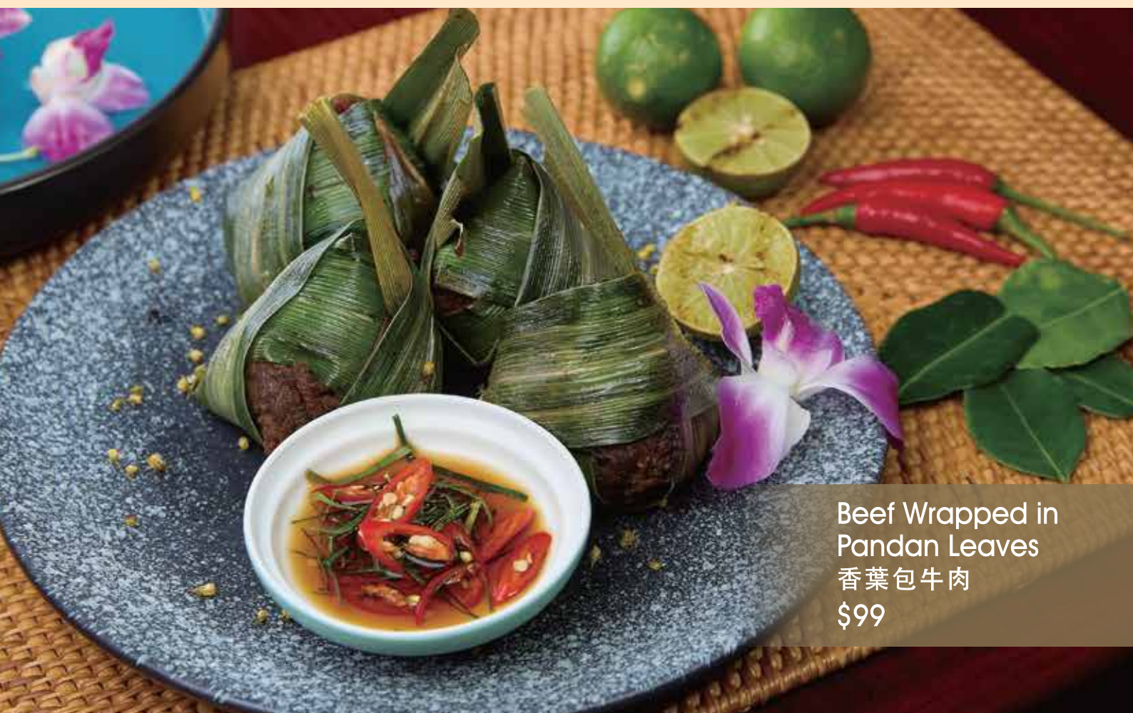
Beef Wrapped in Pandan Leaves 香葉包牛肉 $99