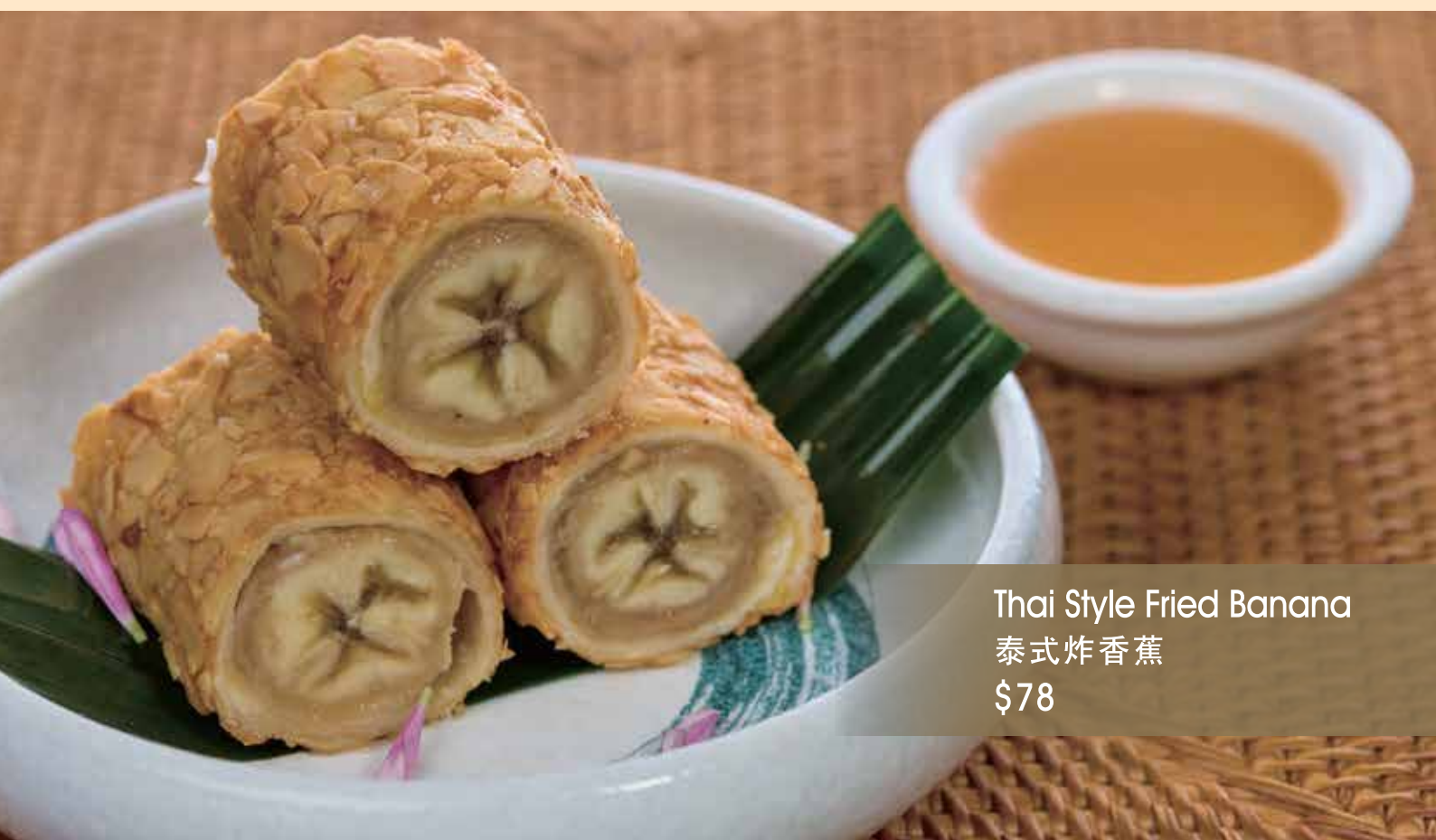
Thai Style Fried Banana 泰式炸香蕉 $78