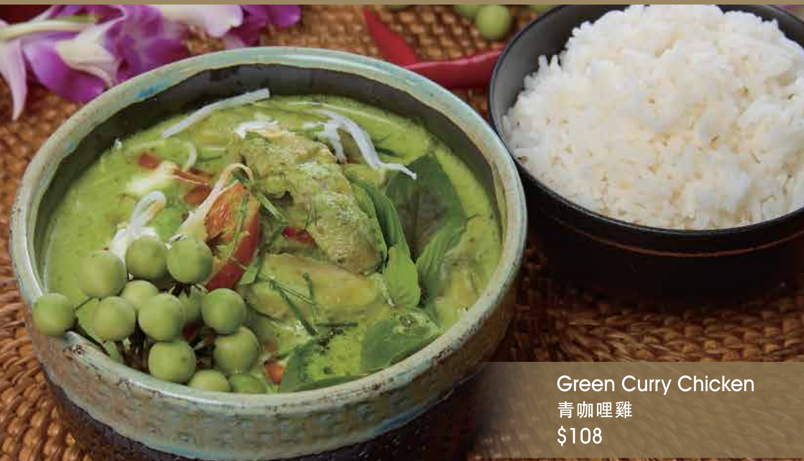
Green Curry Chicken 青咖哩雞 $108