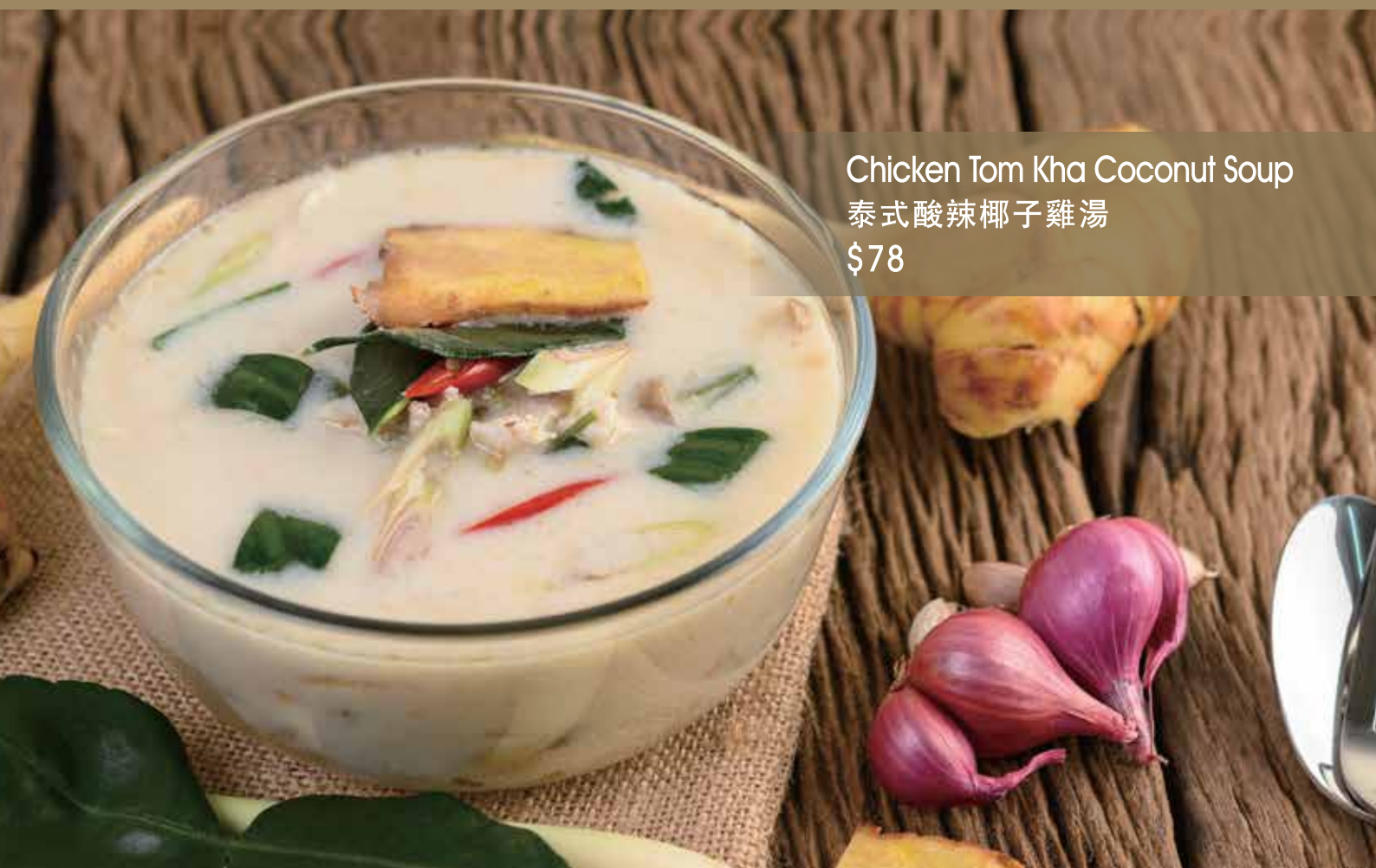
Chicken Tom Kha Coconut Soup 泰式酸辣椰子雞湯 $78