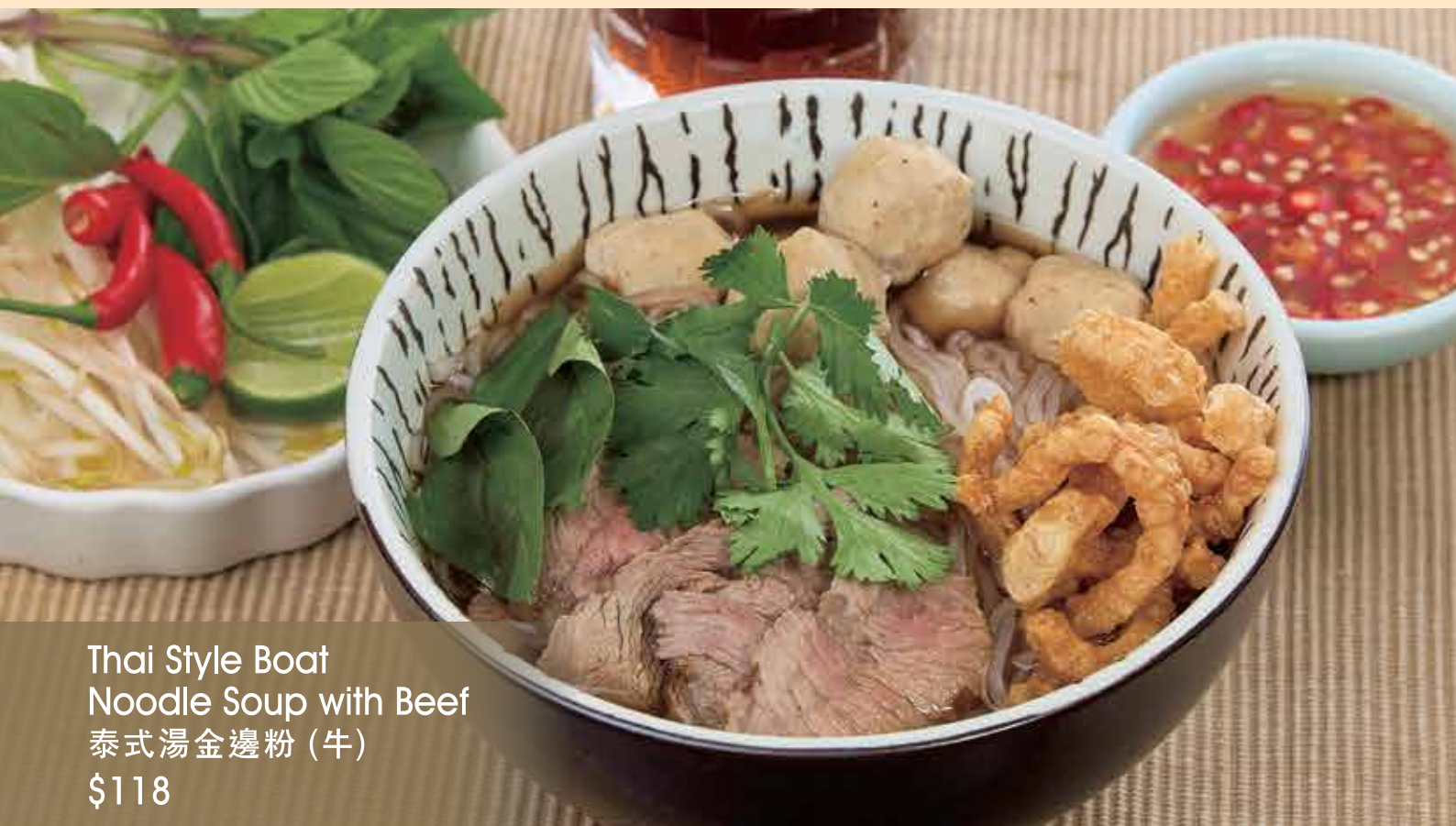
Thai Style Boat Noodle Soup with Beef 泰式湯金邊粉 (牛) $118