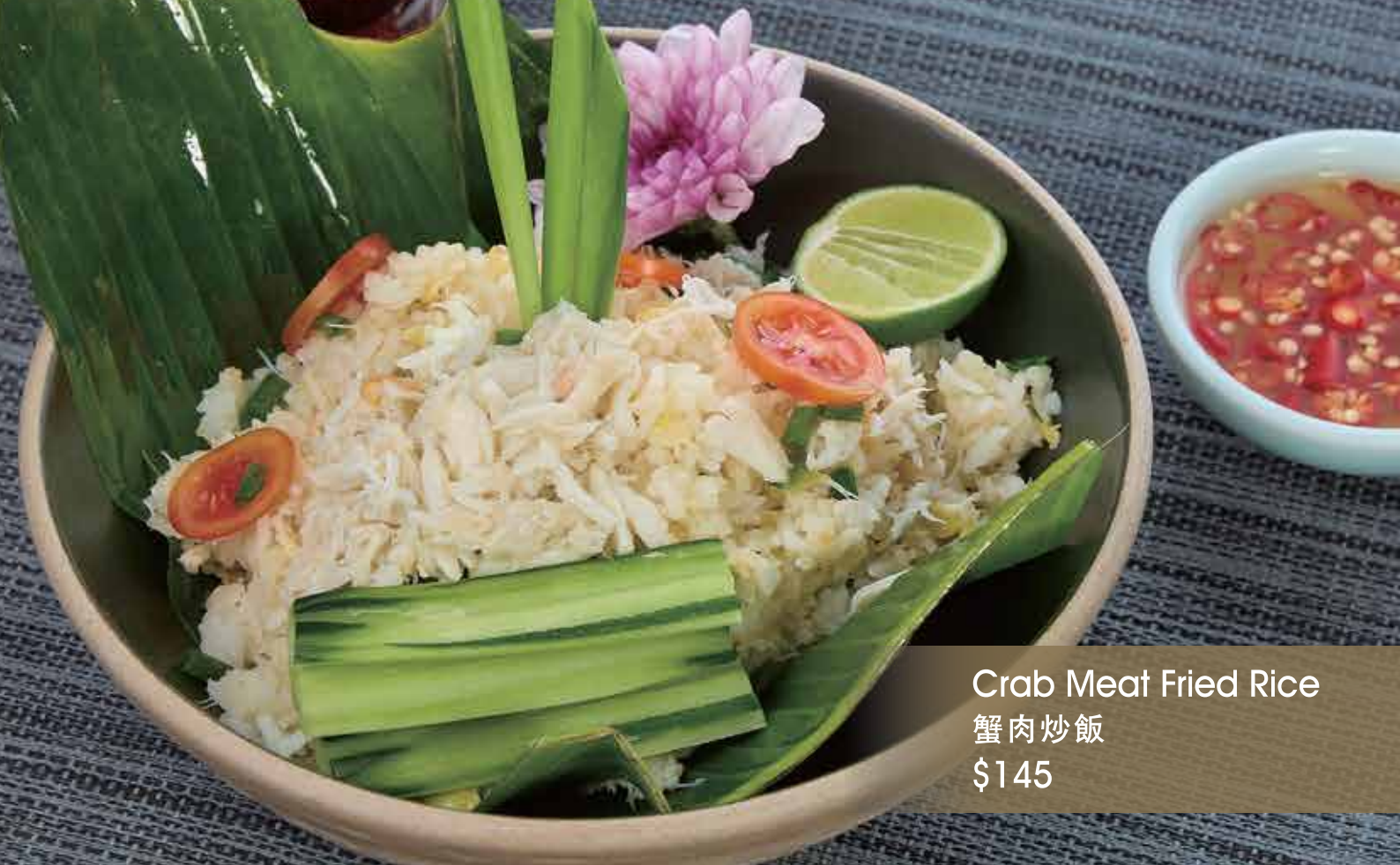
Crab Meat Fried Rice 蟹肉炒飯 $145