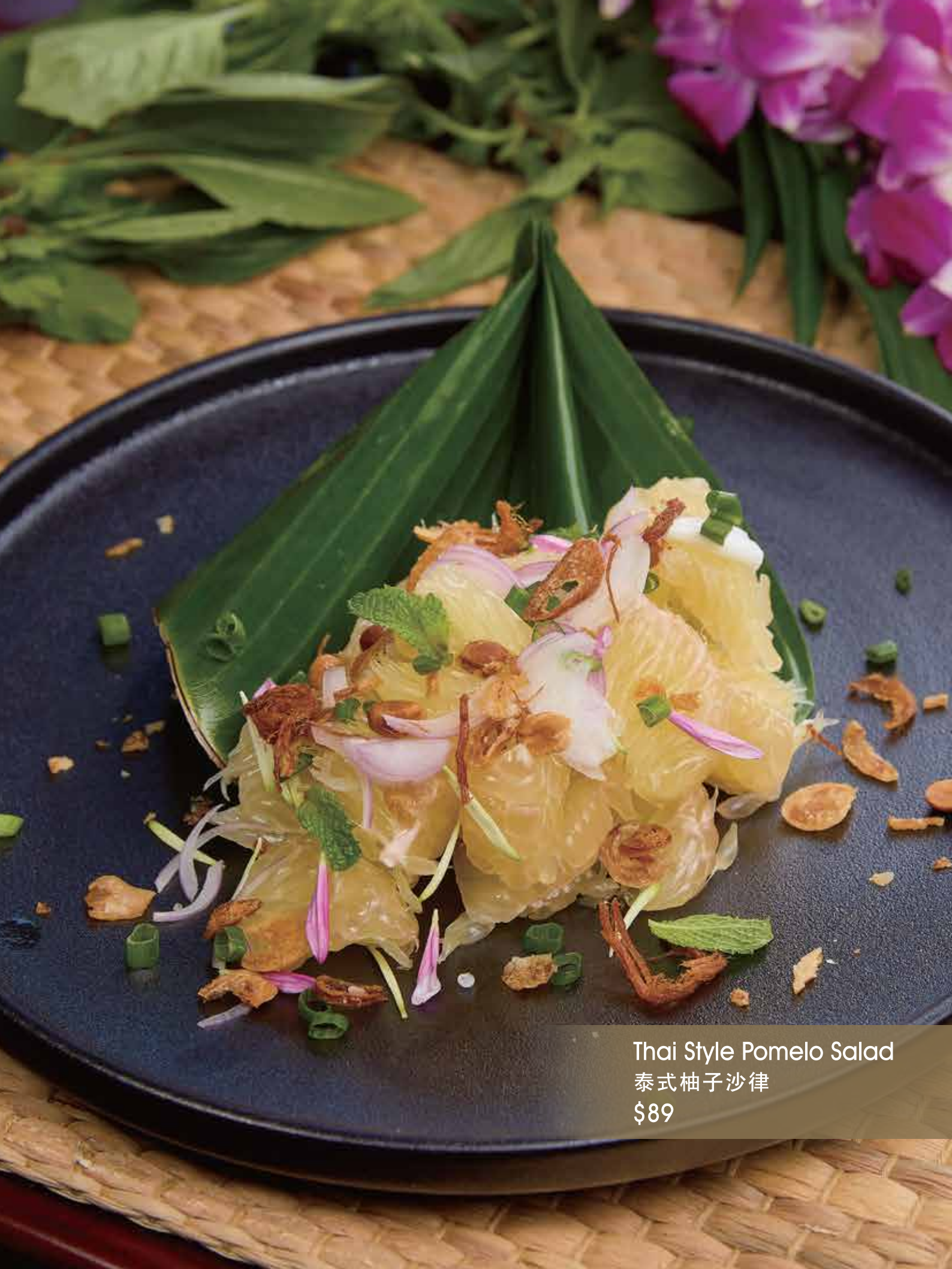
Thai Style Pomelo Salad 泰式柚子沙律 $89