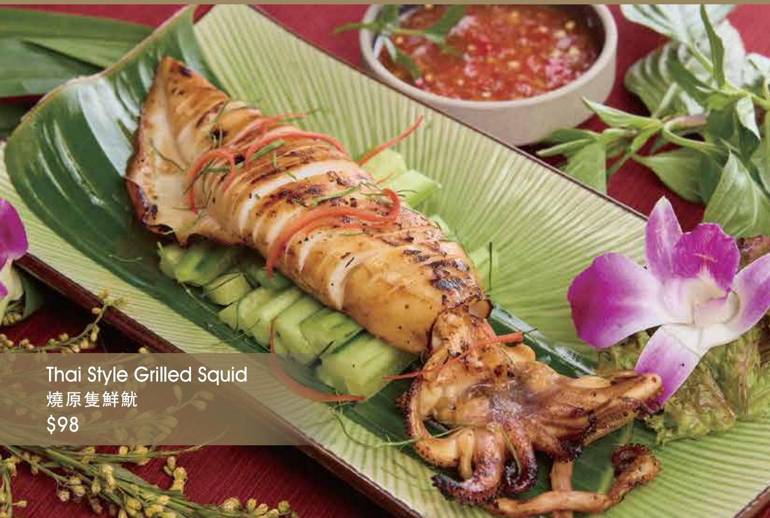
Thai Style Grilled Squid 燒原隻鮮魷 $98

Thai Style Deep Fried Spring Roll w/ Stuffed Crab Meat & Chicken $89 泰式蟹雞肉春卷