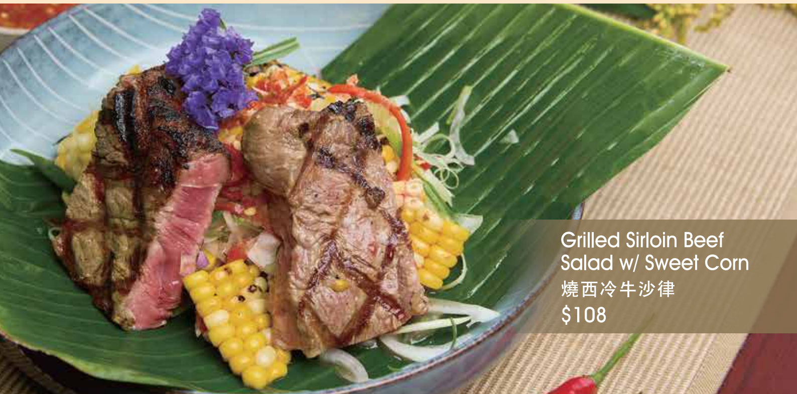
Grilled Sirloin Beef Salad w/ Sweet Corn 燒西冷牛沙律 $108